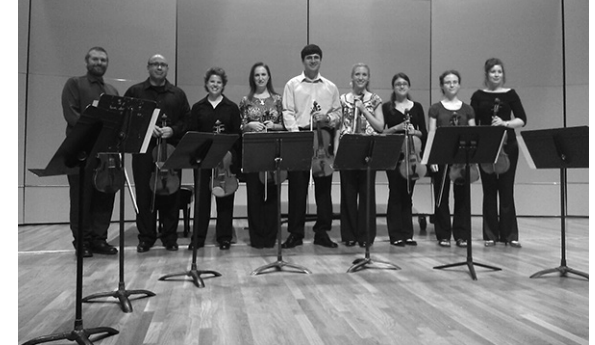
Viola Day 2011 Faculty Concert

Suite for viola and piano (1919) Ernest Bloch (1880-1959)